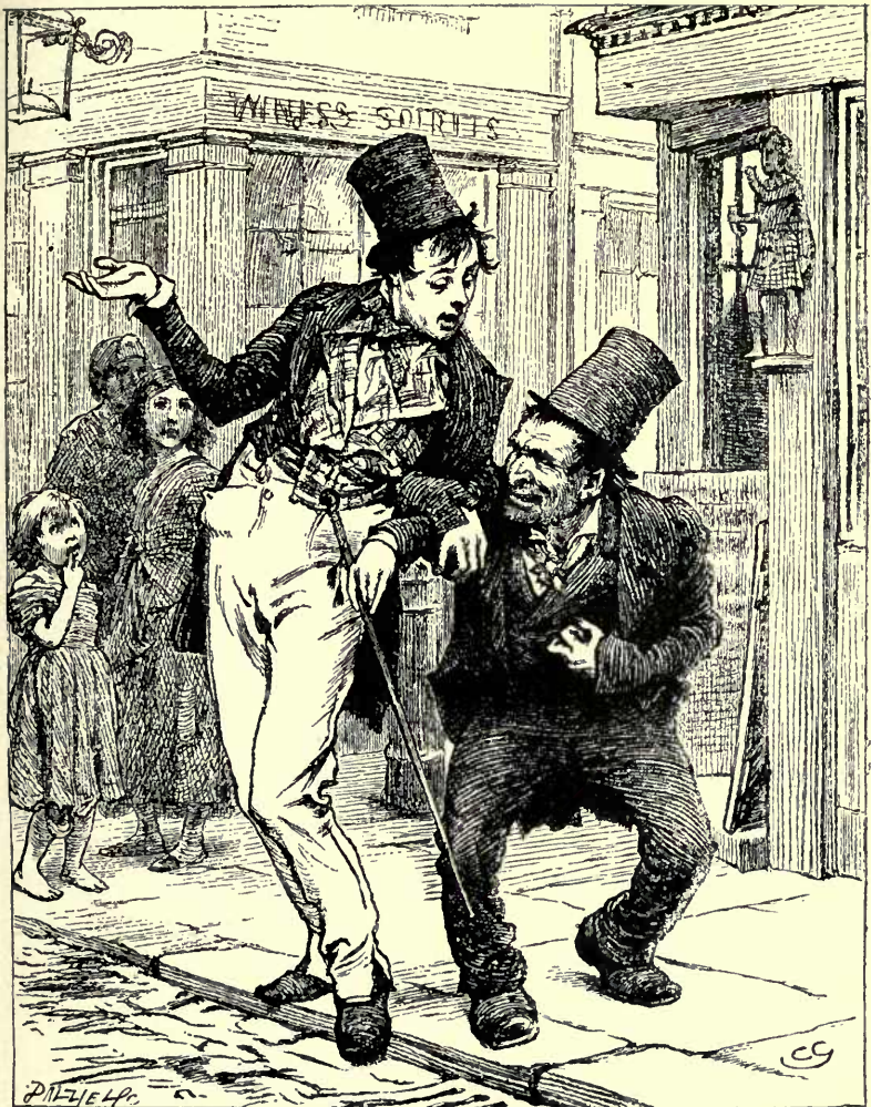
AND THEN THEY WENT ON ARM-IN-ARM.